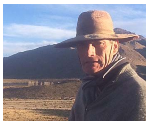
Millionaires Are Taking This Farmer's Warning Seriously MoneyWise 411