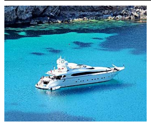
3 Billionaires Say: Something Big Coming Soon In U.S.A. The Crux