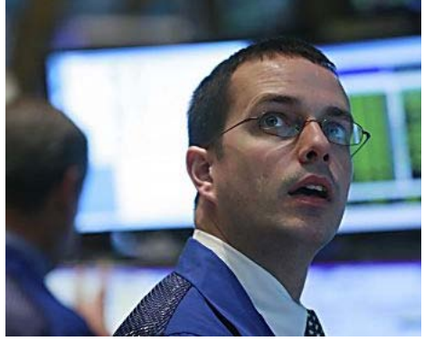
Investing in what may be the "Biggest Event in Human History" www.fool.com